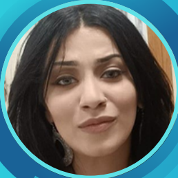
Manar AlSharif Political Activist and Journalist

TAU Canada is proud to partner with an outstanding roster of speakers and panelists for the Trauma to Triumph Campaign.